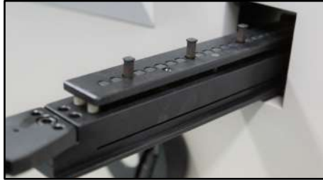
Wide range of quality punch dies with removable pins