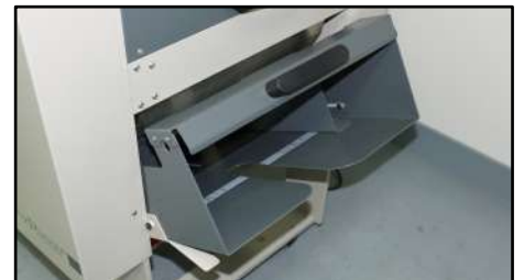
Reception with capacity up to 4" (2 reams ~ 1,000 sheets)