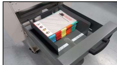
Retractable reception allowing easy handling of punched sheets