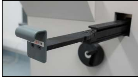
Easy die change in less than 2 minutes