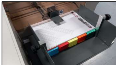
Adjustment of the feeder with magnetic and sliding stops