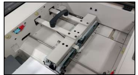
Proven technology from DocuPunch® PLUS