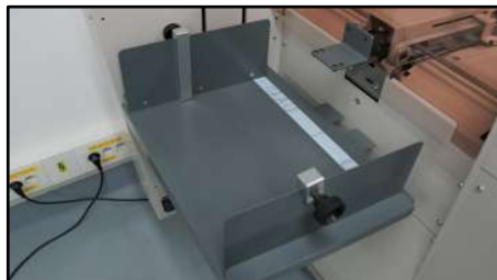
Feeder with capacity up to 4" (2 reams ~ 1,000 sheets)