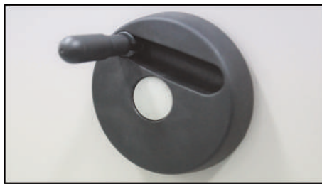
Easy format set-up with simple hand wheel activating the side lay gauges of the central transport unit