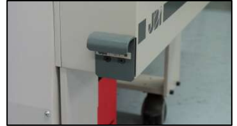
Storage space for 1 die