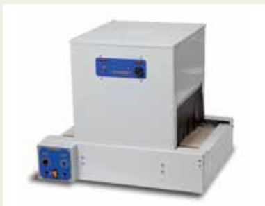
Clamco 820 shrink tunnel

Our family of Clamco tabletop sealers and shrink tunnels are the perfect solution for dependable, long-life performance. Designed for smaller production demands, these products are constructed of heavy-gauge materials and combine advanced engineering with rugged, time-proven features. Each is expertly crafted by Clamco, the industry's respected name for reliability and value.