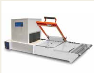
Clamco Combo Junior shrink wrap system