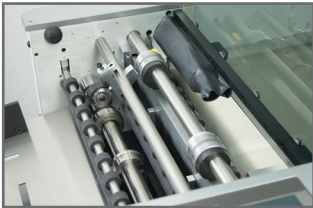
CAM Actuated Compression Creasing

Combines creasing and perforating in one simple yet powerful machine.