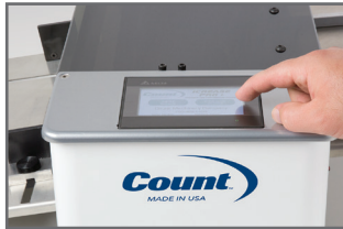
Touch Screen Controller

The COUNT™ iCrease Pro + is a robust solution for creasing and perforating digital media to eliminate cracking when folding. Get the automation of bigger COUNT machines in a simple hand-feed machine anyone can use. The iCrease Pro + can crease and perf in one pass (no need to refeed!), with multiple crease locations and perfect bind covers, with choice of automatic hinge placement or no hinge.