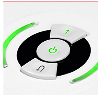
Dynamic Load Sensor shows users if they are feeding items at the appropriate rate or if they should feed faster or slower