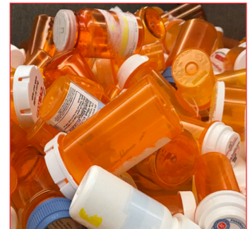
Destroy a wide range pill bottle sizes up to 16 oz. including lids. Accepts wet or dry bottles