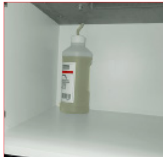
Automatic oiler keeps cutting head lubricated for peak performance - easy change bottle eliminates the hassle of filling a reservoir