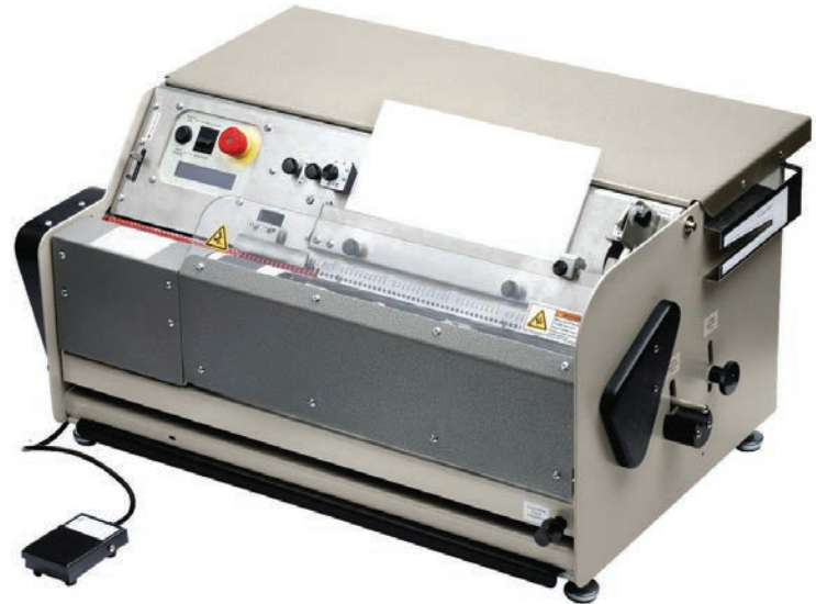
Side Lay Tool