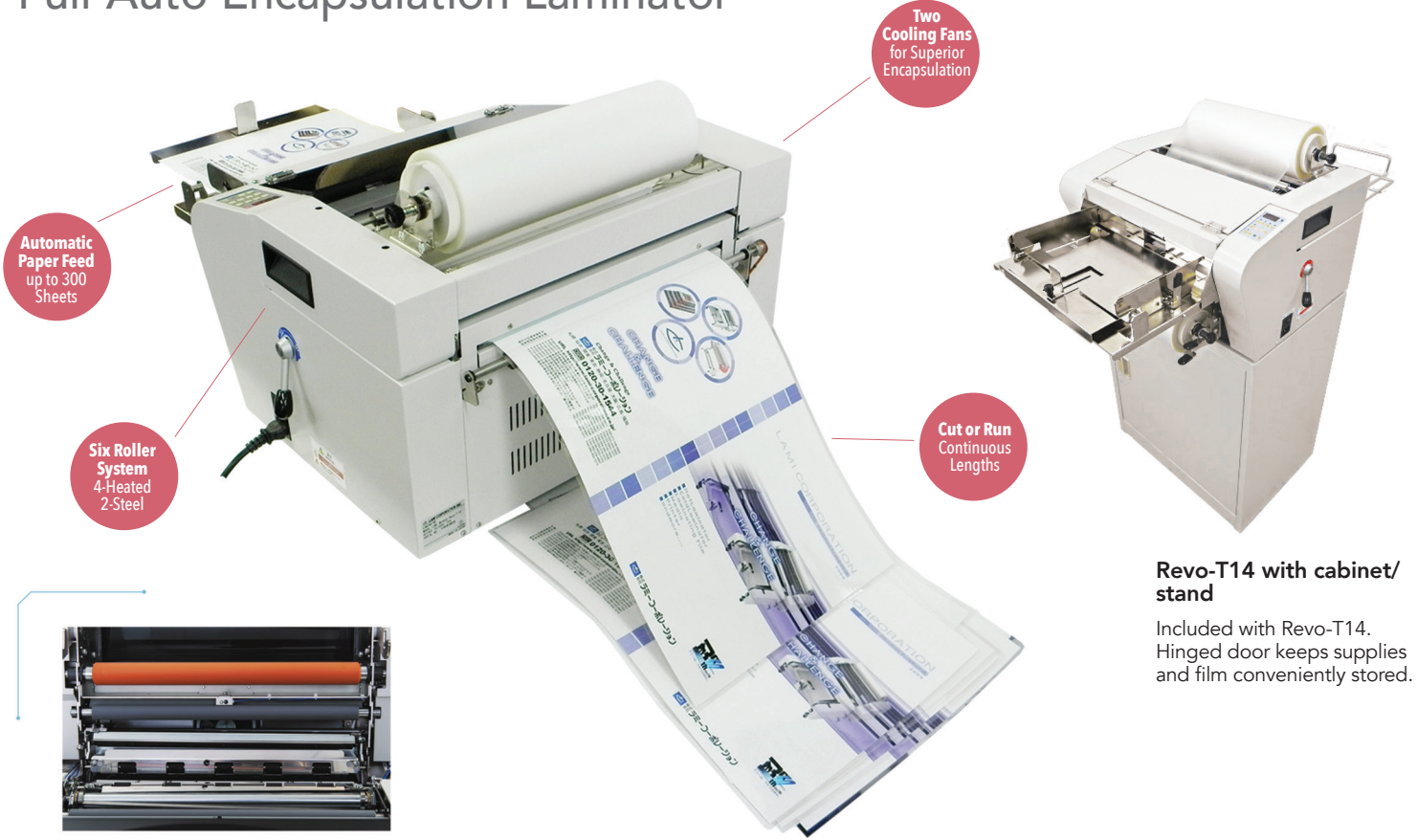
Revo-T14 with cabinet/stand

Included with Revo-T14. Hinged door keeps supplies and film conveniently stored.