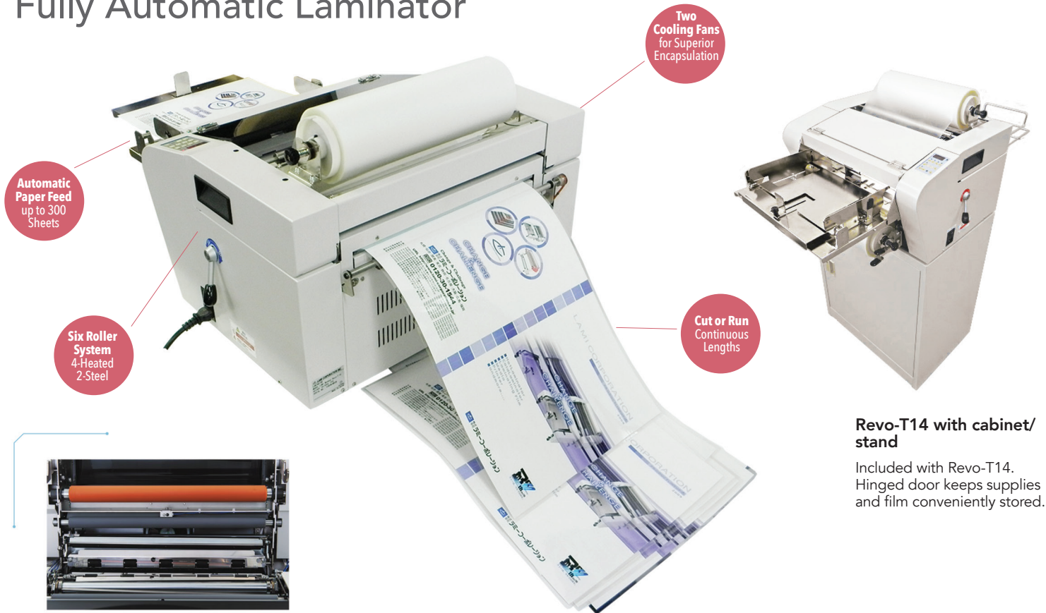
Revō-T14 with cabinet/stand

Included with Revō-T14. Hinged door keeps supplies and film conveniently stored.