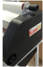
Adjustable Tension Knobs