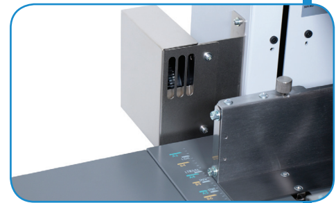
Side Air System: Enhances feeding of heavy stock and large paper sizes