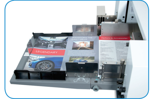
Extended Infeed Tray with Air Suction Feeder: Handles sheets up to 25.5" long, using both optical and ultrasonic sensors for accurate sheet feeding