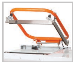
Temp controlled seal system