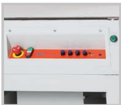
User friendly controls