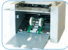
Output conveyor for neat & sequential stacking