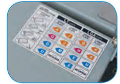
Clearly marked fold guide for quick and easy setup