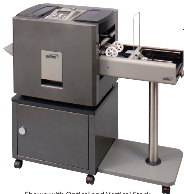
Shown with Optical and Vertical Stack

The most advanced heavy duty desktop pressure sealer