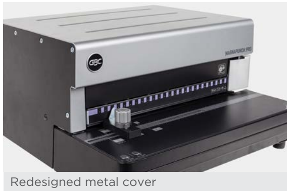
Redesigned metal cover