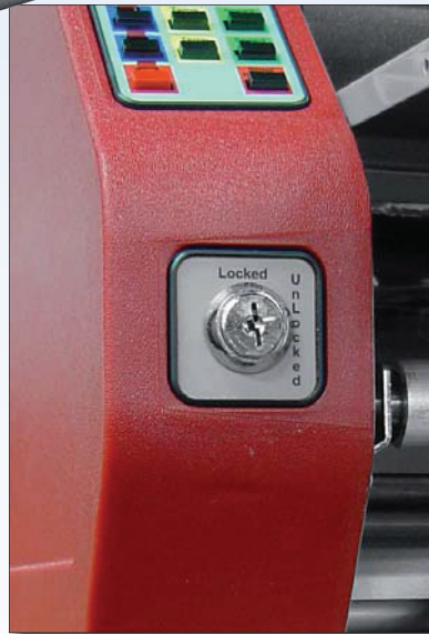
Key Switch Prevents Unauthorized Users