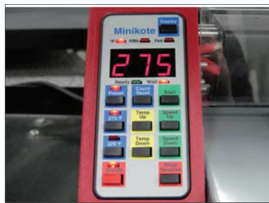
Touch Pad Controls