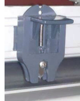
Auto grips to secure User friendly controls Cross cutter permits film cores to feed and simplify operation wind up rollers